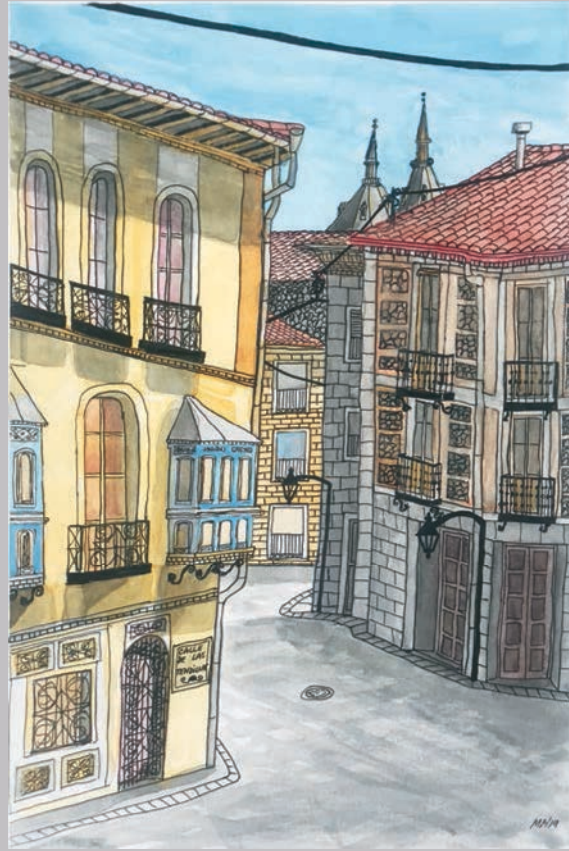
▲ Toledo, Spain